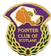
Billy Darragh (2085).