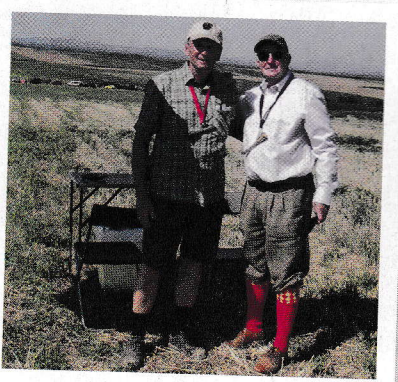
Dogs and handlers basking in the sunshine at the summer field trials.